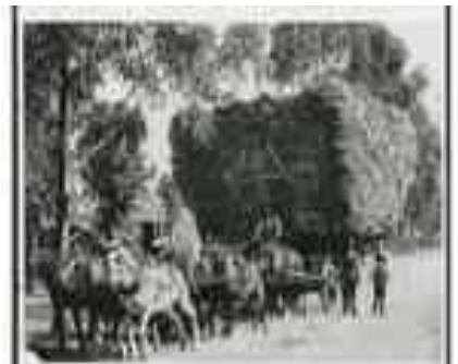
A load of hay being transported in Riverton c1890

CLOSIND DATE for next edition of GVNews 24 th August 2012